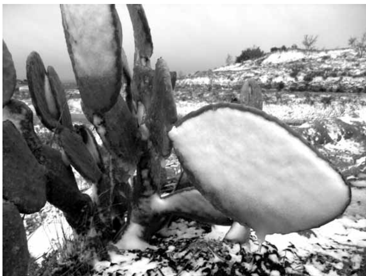
Snow and Chumbos – a rare sight indeed!