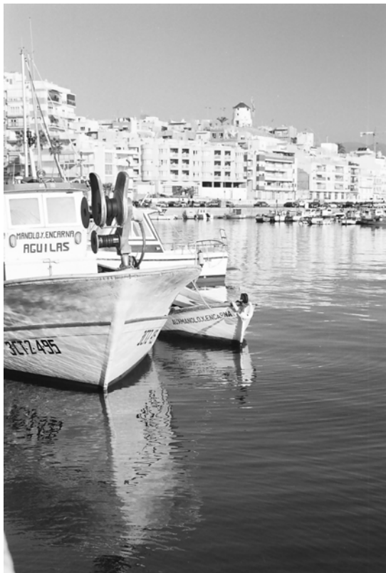
Harbour at Águilas

There are trains to Murcia and Lorca, with 3 daily trains to each.